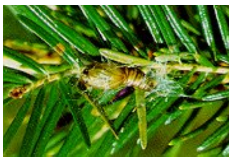
Figure 7- Pupa of the spruce budworm.