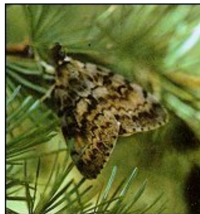
Figure 9 - Male gypsy moth.

The male gypsy moth emerges first, flying in rapid zigzag patterns searching for females. When heavy, egg-laden females emerge, they emit a chemical substance called a pheromone that attracts the males (fig. 9). The female lays her eggs in July and August close to the spot where she pupated (fig. 10). Then, both adult gypsy moths die.