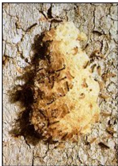
Figure 3 - Gypsy moth larvae emerging from egg mass.

The hatching of gypsy moth eggs coincides with budding of most hardwood trees. Larvae emerge from egg masses from early spring through mid-May (fig. 3).