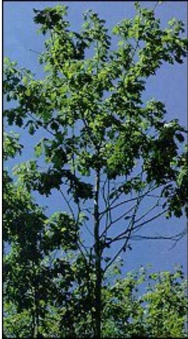
Figure 11 - Tree before defoliation.