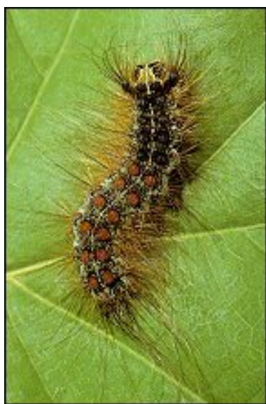
Figure 5 - Older Gypsy moth larvae showing five pairs of raised blue spots and six pairs of raised brick-red spots.

During the first three instars, larvae remain in the top branches or crowns of host trees. The first stage or instar chews small holes in the leaves (fig. 6). The second and third instars feed from the outer edge of the leaf toward the center.