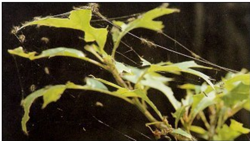
Figure 4 - Gypsy moth larvae suspended on silken threads.

Larvae develop into adults by going through a series of progressive molts through which they increase in size. Instars are the stages between each molt. Male larvae normally go through five instars (females, through six) before entering the pupal stage. Older larvae have five pairs of raised blue spots and six pairs of raised brick-red spots along their backs (fig. 5).