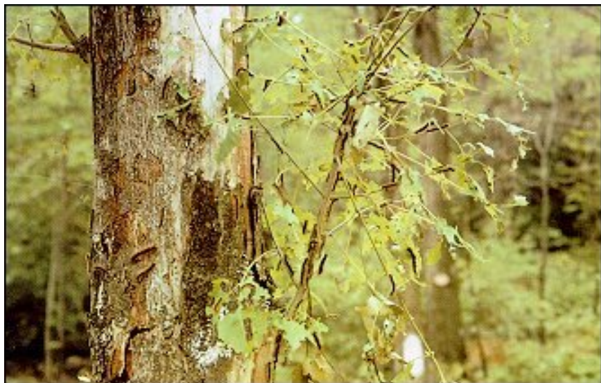
Figure 7 - A tree stripped by gypsy moth larvae

When population numbers are dense, larvae feed continuously day and night until the foliage of the host tree is stripped (fig. 7). Then they crawl in search of new sources of food.