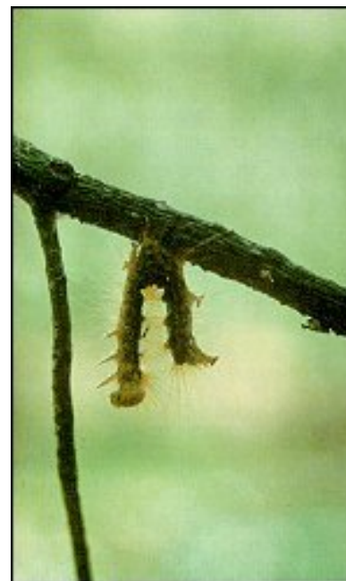
Figure 13 - Larvae infected by the nucleopolyhedrosis virus (NPV) hanging in an inverted "V" position.

Weather affects the survival and development of gypsy moth life stages regardless of population density. For example, temperatures of -20^{\circ}\text{F} . ( -29^{\circ}\text{C} .) lasting from 48 to 72 hours can kill exposed eggs; alternate periods of freezing and thawing in late winter and early spring may prevent the overwintering eggs from hatching; and cold, rainy weather inhibits dispersal and feeding of the newly hatched larvae and slows their growth.