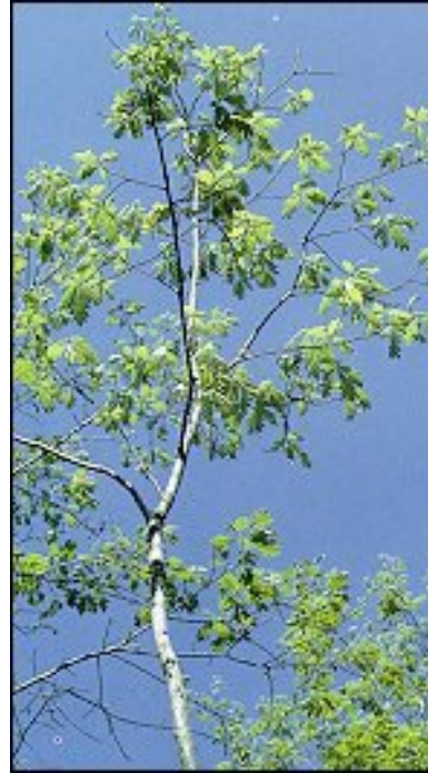
Figure 12 - Tree after refoliation.

Trees use energy reserves during refoliation and are eventually weakened. Weakened trees exhibit symptoms such as dying back of twigs and branches in the upper crown and sprouting of old buds on the trunk and larger branches. Weakened trees experience radial growth reduction of approximately 30 to 50 percent.