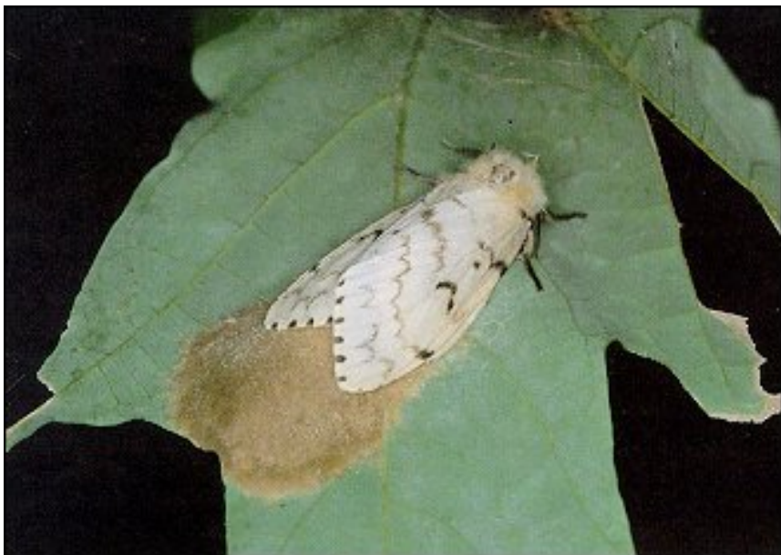
Figure 10 - Female gypsy moth laying eggs.