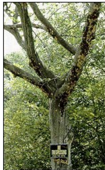
Figure 2 - Gypsy moth egg masses on the trunk and branch of a tree.

Larvae are dispersed in two ways. Natural dispersal occurs when newly hatched larvae hanging from host trees on silken threads (fig. 4) are carried by the wind for a distance of about 1 mile. Larvae can be carried for longer distances. Artificial dispersal occurs when people transport gypsy moth eggs thousands of miles from infested areas on cars and recreational vehicles, firewood, household goods, and other personal possessions.