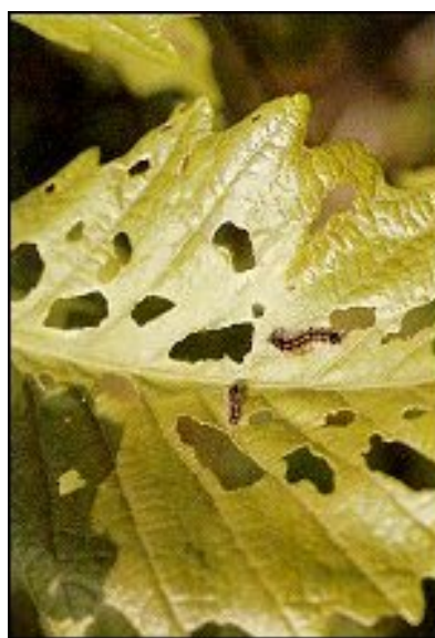
Figure 6 - First instar gypsy moth larvae chewing small holes in leaves.

When population numbers are sparse, the movement of the larvae up and down the tree coincides with light intensity. Larvae in the fourth instar feed in the top branches or crown at night. When the sun comes up, larvae crawl down the trunk of the tree to rest during daylight hours. Larvae hide under flaps of bark, in crevices, or under branches - any place that provides protection. When larvae hide underneath leaf litter, mice, shrews, and Calosoma beetles can prey on them. At dusk, when the sun sets, larvae climb back up to the top branches of the host tree to feed.