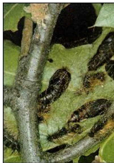
Figure 8 - Gypsy moth pupa.

The larvae reach maturity between mid-June and early July. They enter the pupal stage (fig. 8). This is the stage during which larvae change into adults or moths. Pupation lasts from 7 to 14 days. When population numbers are sparse, pupation can take place under flaps of bark, in crevices, under branches, on the ground, and in other places where larvae rested. During periods when population numbers are dense, pupation is not restricted to locations where larvae rested. Pupation will take place in sheltered and non-sheltered locations, even exposed on the trunks of trees or on foliage of nonhost trees.