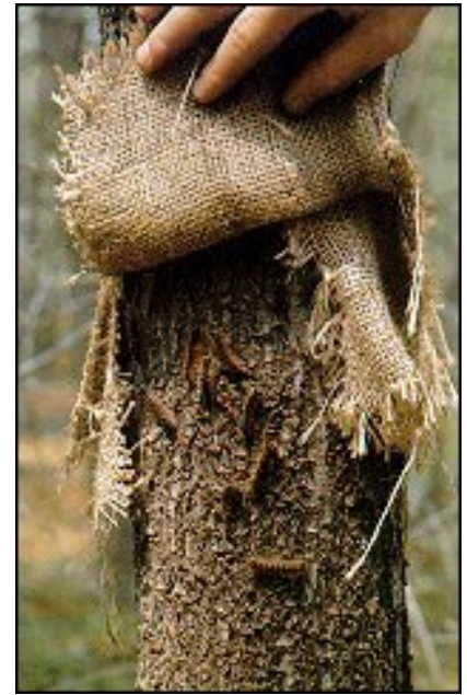
Figure 14 - Gypsy moth larvae and pupae under burlap